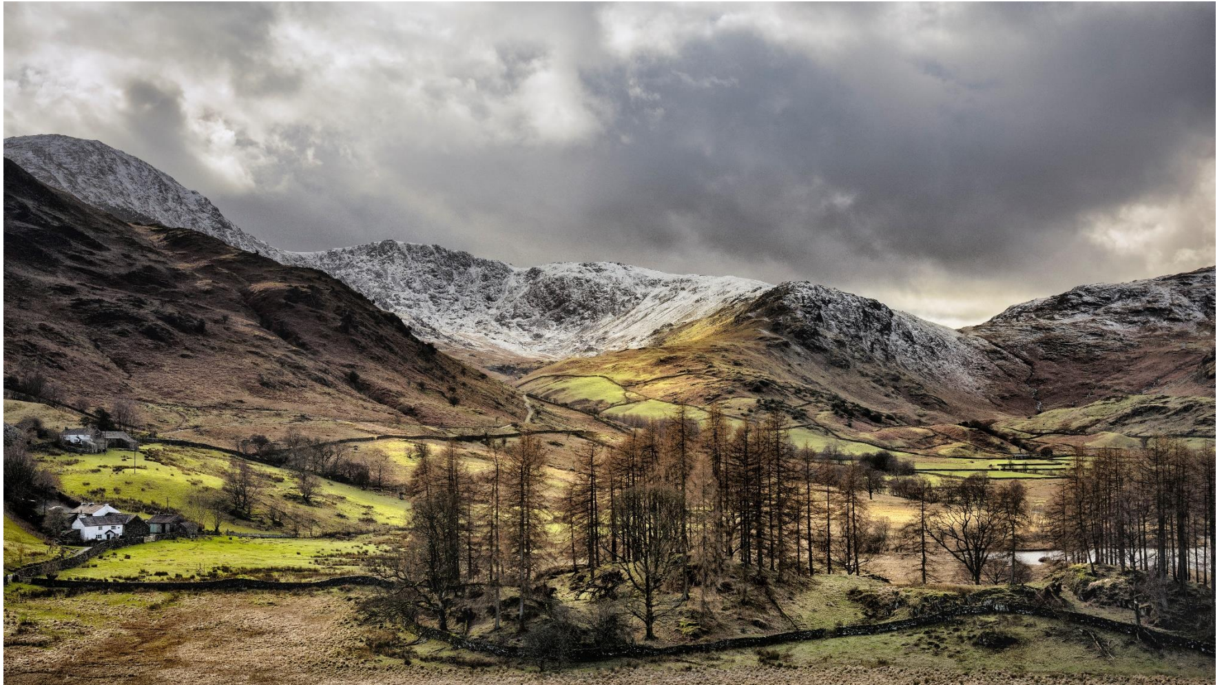
Little Langdale Cottage