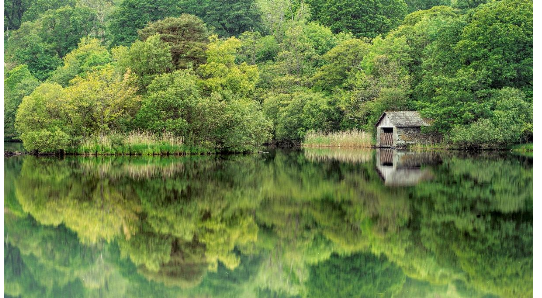
Rydal Boat House