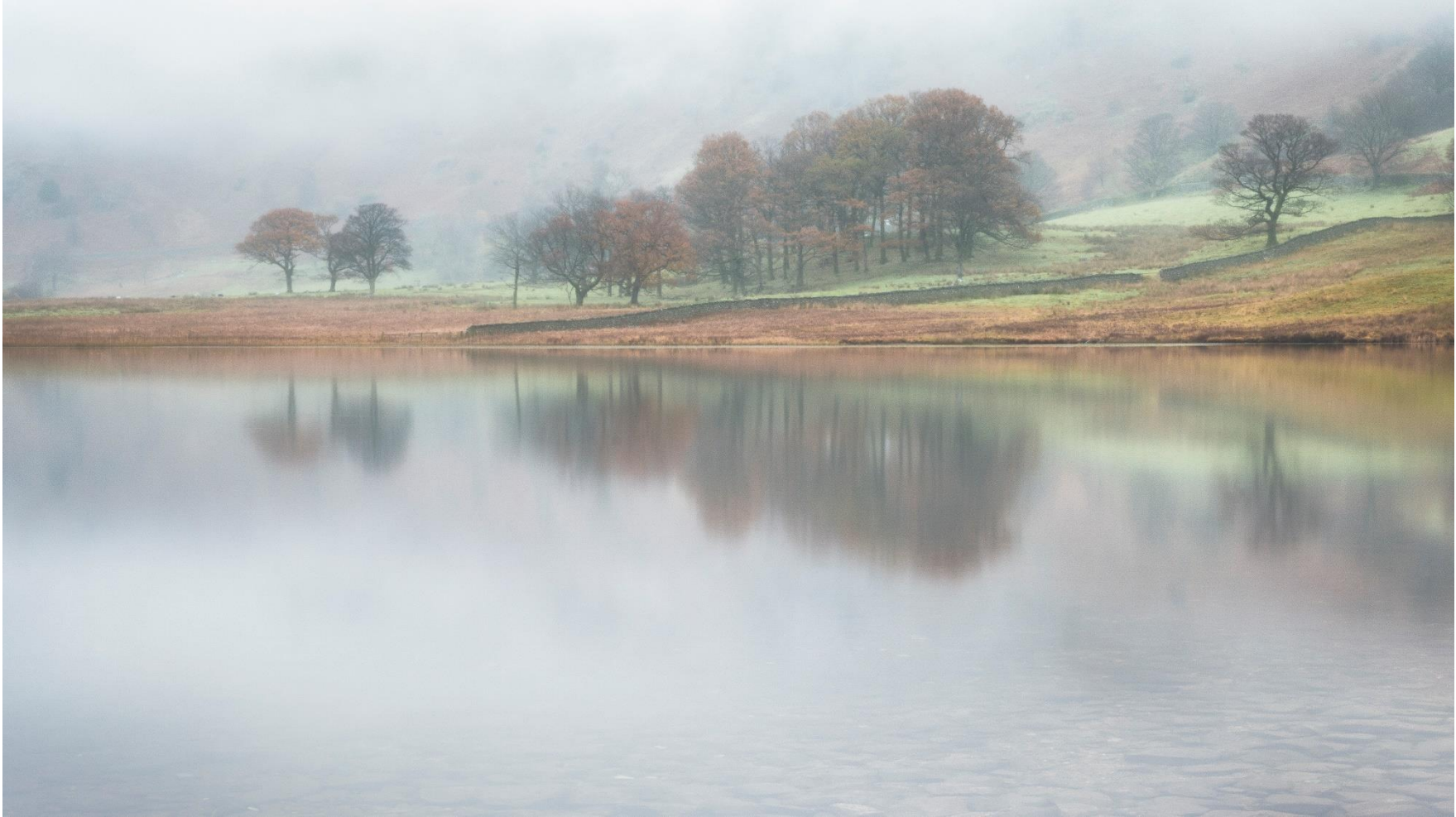
Blea Tarn Calm